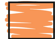
Nurturing Skills Learner Fund

Enquire today about the Nurturing Skills Learner Fund (NSLF) as places will be limited and on a first come, first served basis.